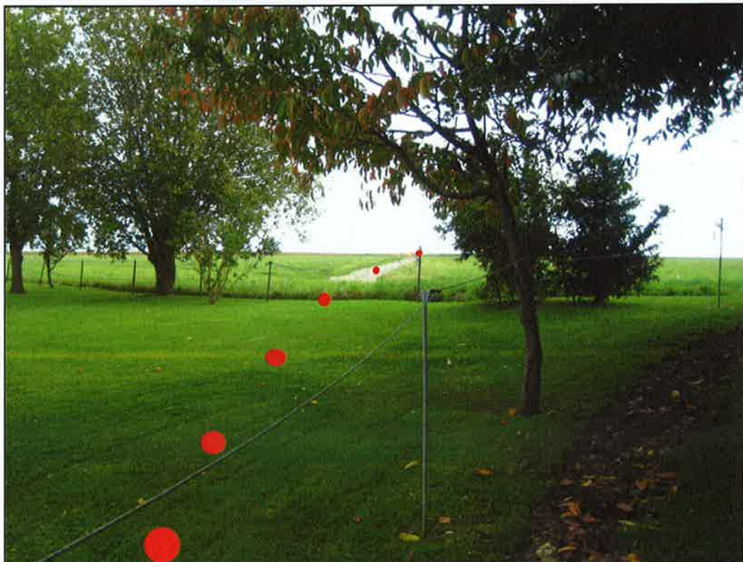
Fig. 2: From between Points B and C on the Plan looking southeast across the garden of Manor Court towards the airstrip.