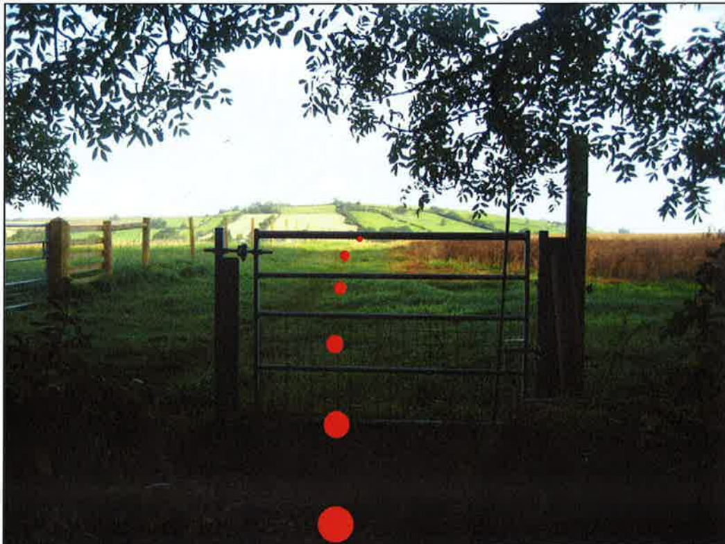
Fig. 4: From Point F on the Plan looking northwest.