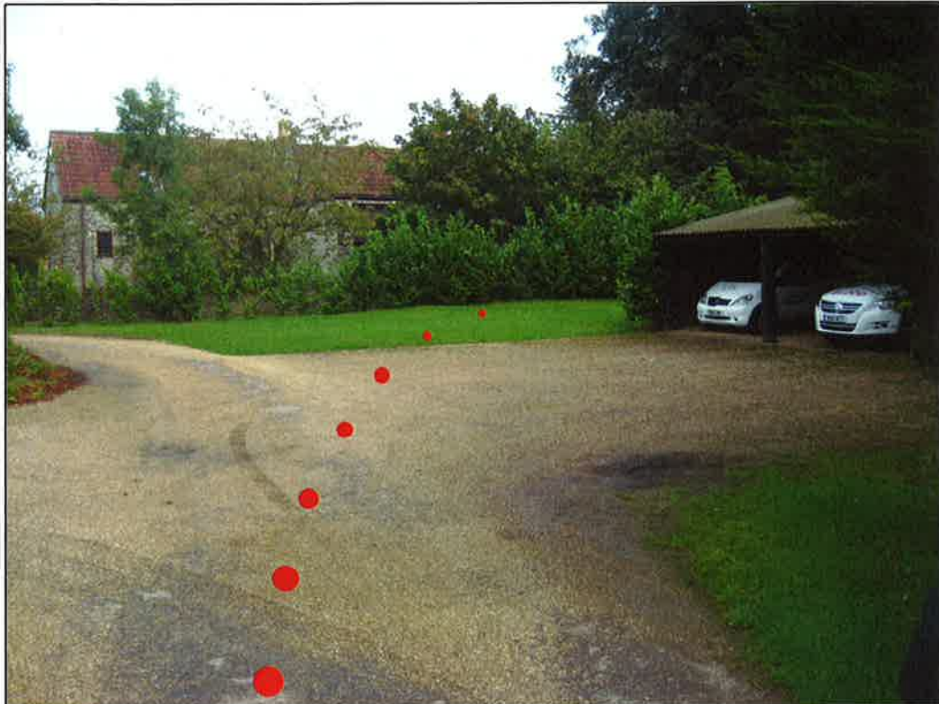
Fig. 1: From Point A on the Plan looking east towards Manor Court.

Approximate alignment of Application Route delineated by red dots